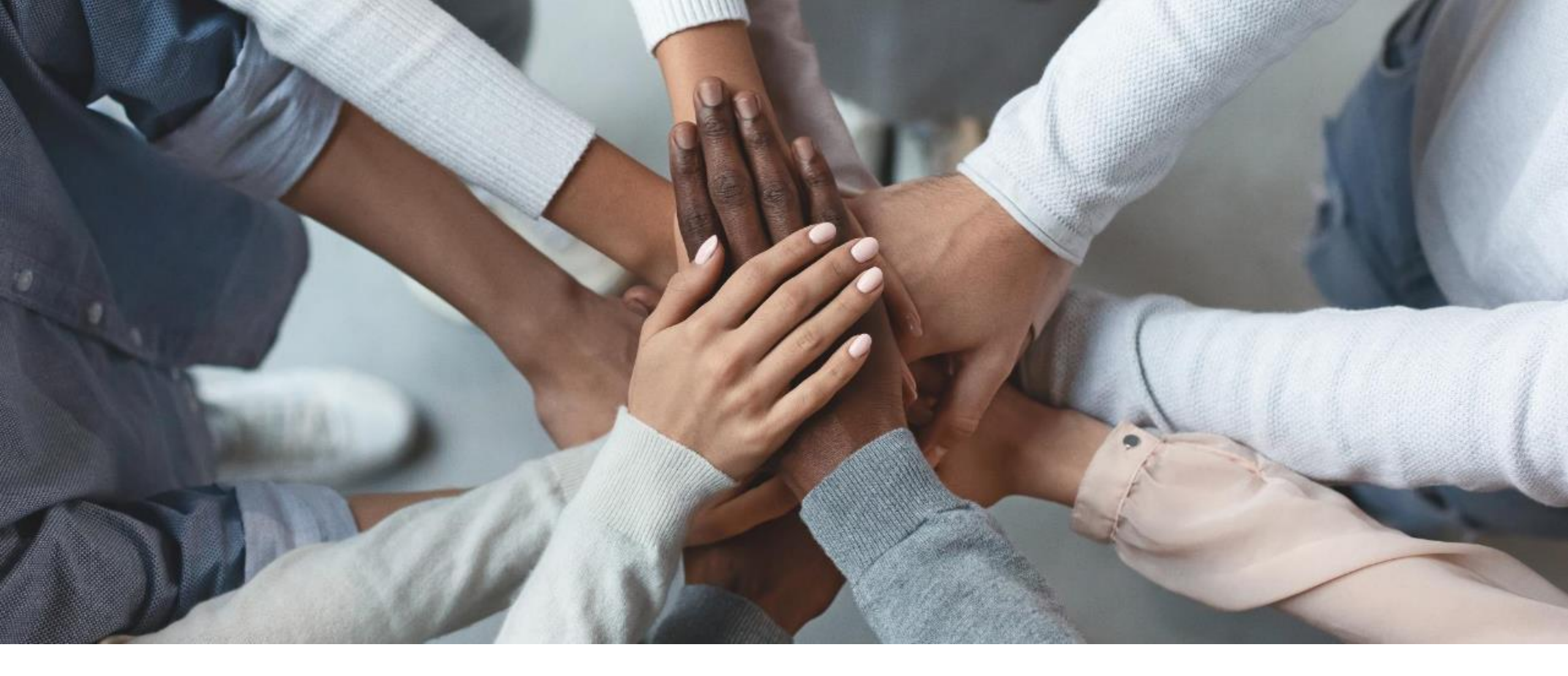
Tribal Care Coordination in ND (presented May 18, 2023)