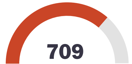
Family and Group Programs