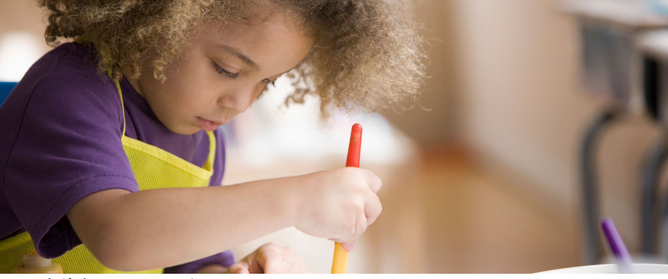
Child Care Assistance Program Updates