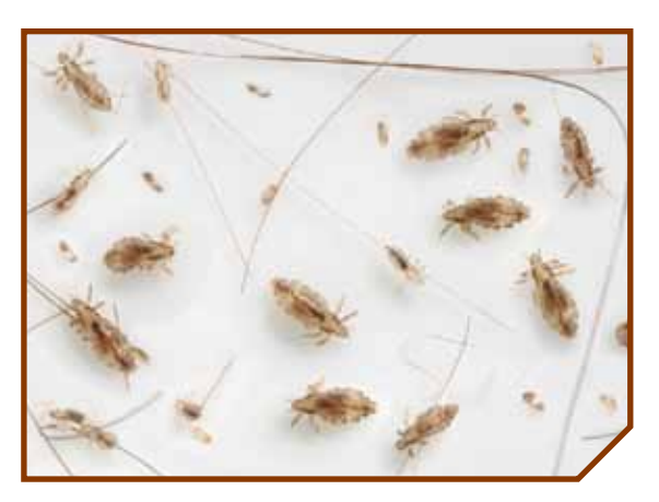
Lice at various stages of development, from egg to adult (magnified)