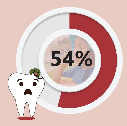
54% of AI/AN kindergartners had cavities in more than 7 teeth.

It is important to take care of your children's teeth when they are very young. This will encourage good oral health habits and decrease the number of children who enter kindergarten with dental problems in North Dakota. In 2019, North Dakotan Kindergartners who were American Indian or Alaska Native (AI/AN) reported high rates of cavities and need for urgent dental care.