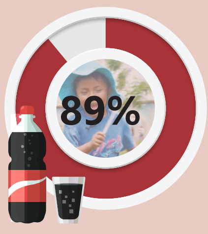
89% of AI/AN kindergartners drink pop daily.