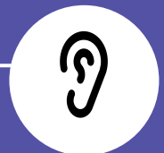
Some ear infections