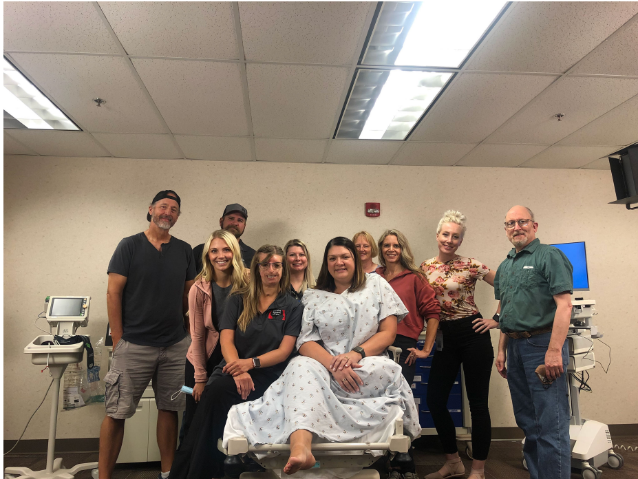
Stroke Educational Videos Production Crew