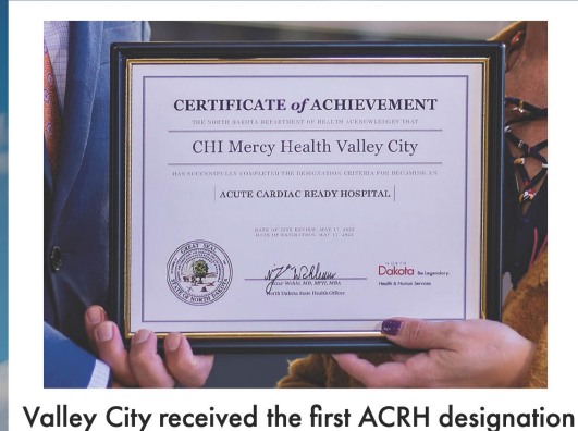
Valley City received the first ACRH designation