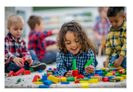
Inclusive Daycare Work

Educate and train people with disabilities to be leaders and increase their advocacy