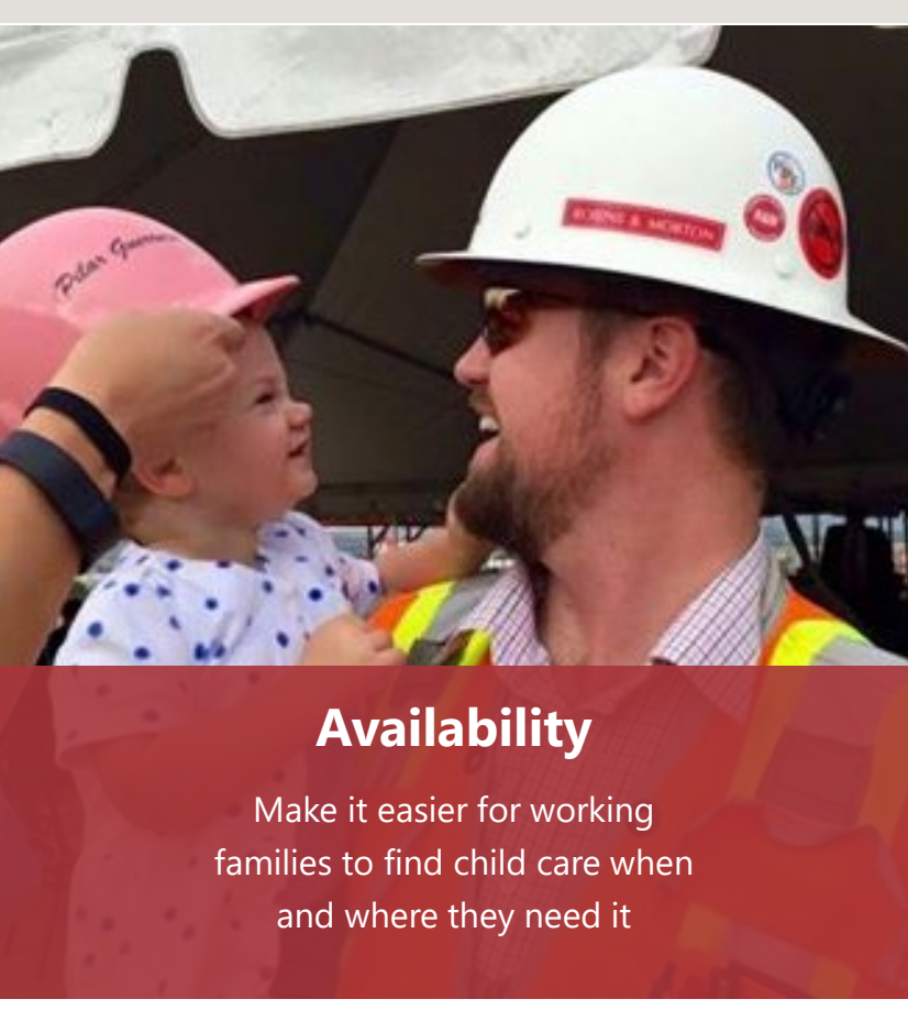
$24.8 million | Payments for Infant and Toddler care | Supporting more sustainable operations for child care entrepreneurs | Care during non-traditional hours | Child care worker career pathways | Criminal background checks