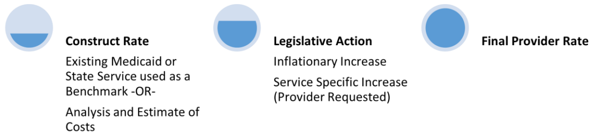
Figure 1 Process Flow for Service Rate Settings

Rates in the DD waiver were created by a vendor who analyzed the provider ledgers and cost reports to develop rates that factored in wages and administrative expenses. Those rates can further be modified to reflect vacancy rates or the acuity level of the waiver participant.